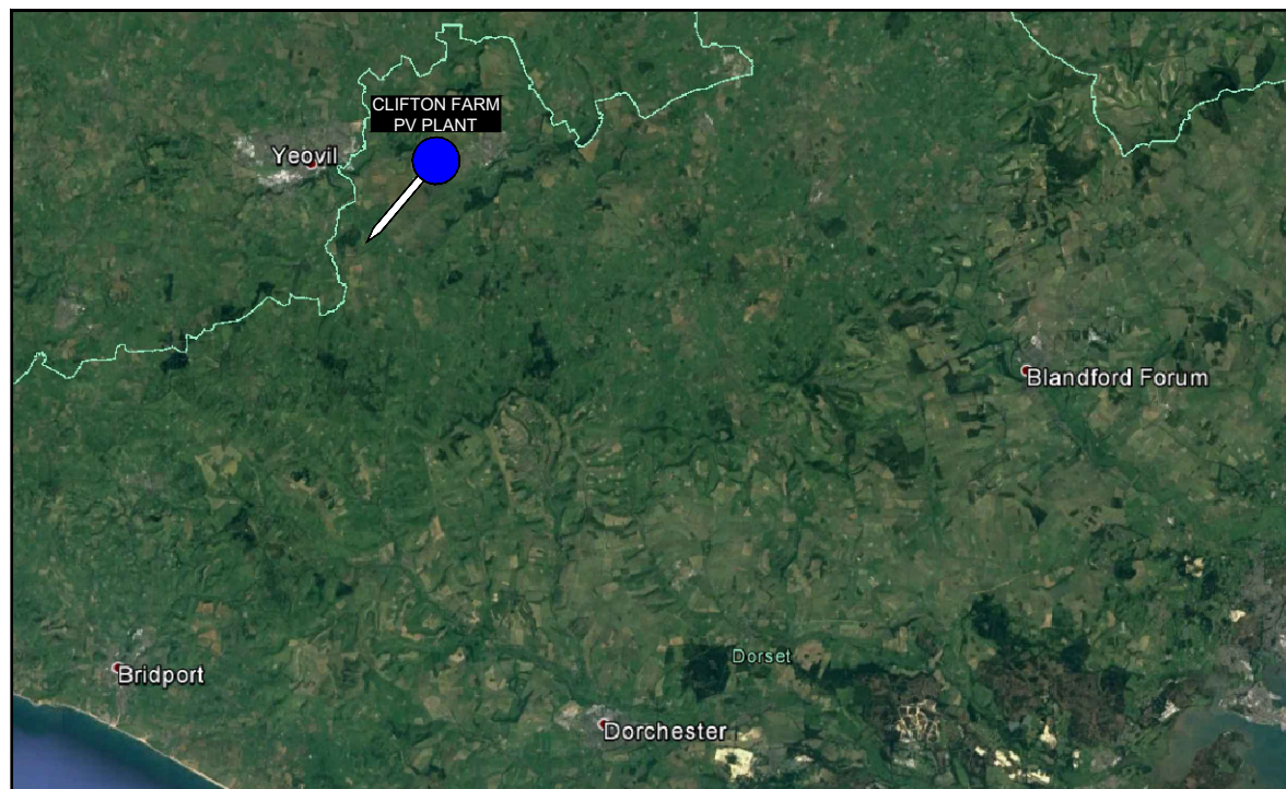
State / Region Location Plan Scale: NS